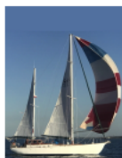
Cover image: Wotama