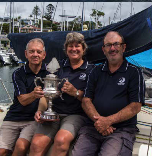
Aboard Simplicity Hart Cup winner 2013 Presentation The Inshore Regatta 2020