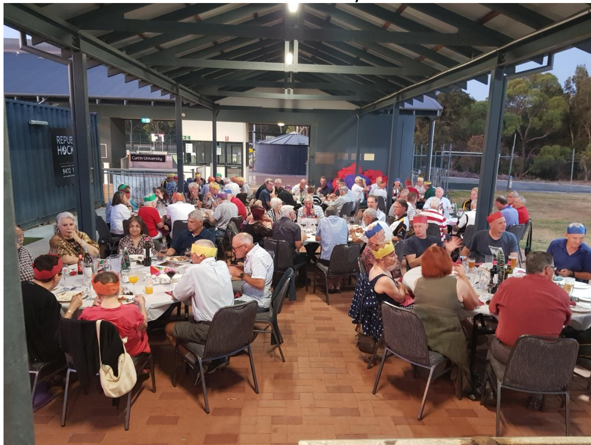
PHS Christmas Party

Punology One: It's hard to explain puns to kleptomaniacs. They always take things literally.