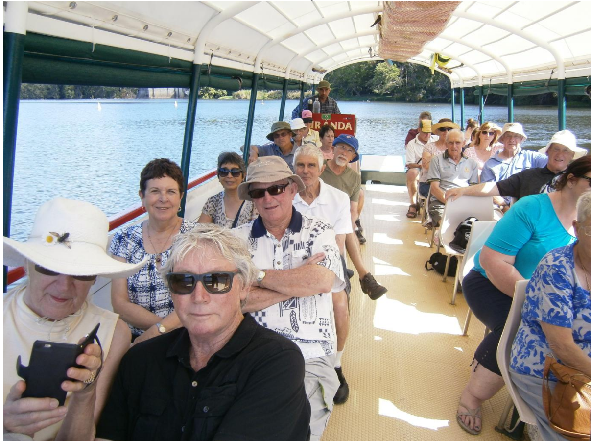
Cairns Tournament - WA Country O/70s cruise the Barron River