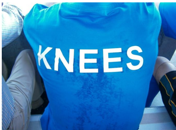
The Hips / Knees playing uniforms - another success