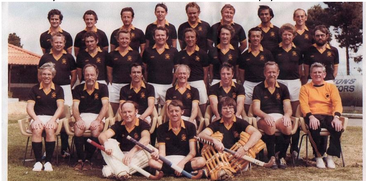
NATIONAL VETERANS CARNIVAL 1980 WA — Metropolitan Team