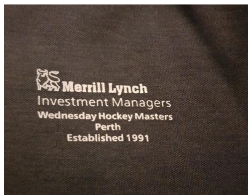
Logo on 2006 playing shirt

Merrill Lynch Mercury Cup: 2004: Mar: White Jun: White Sep: White Dec: White