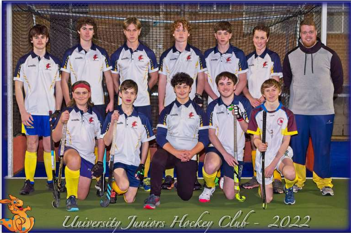
Under 18 - Division 1