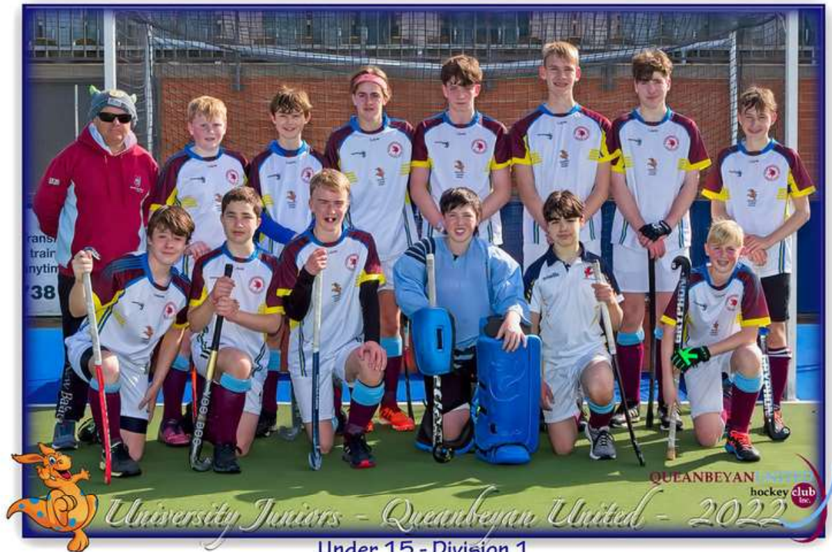
Under 15 - Division 1