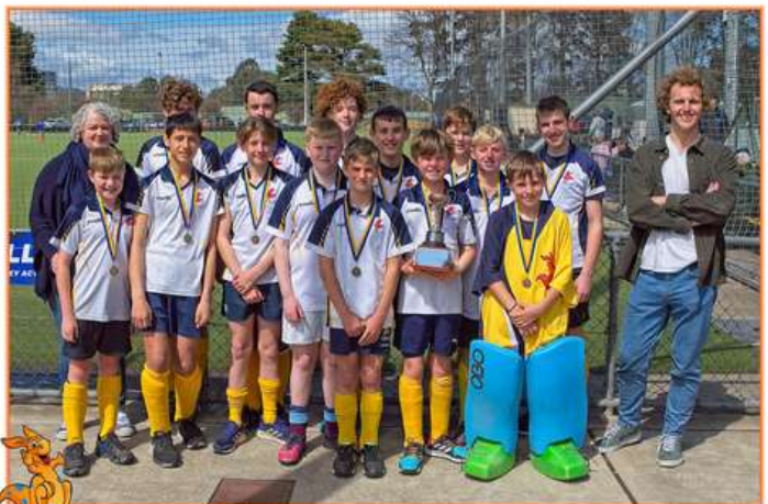
Under 15 - Division 2 - 2022 Premiers