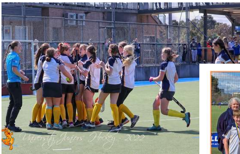
University Juniors Hockey - 2022