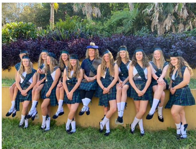
Junior Girls showing skills outside the water!

We are looking for a social media 'guru' to help get the message out so if you have these skills, get in touch, we may even contribute to your Registration fee!!