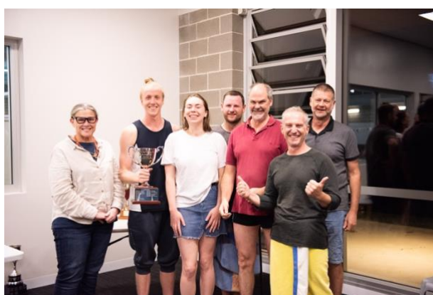
A-Grade Premiers – Dolphins