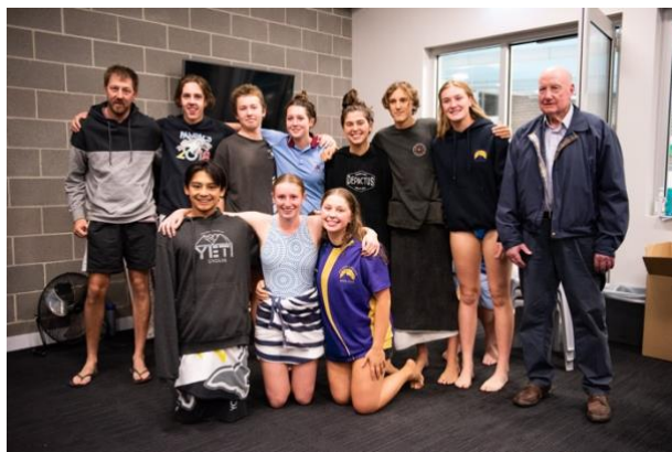
B-Grade Premiers – Polar Bears