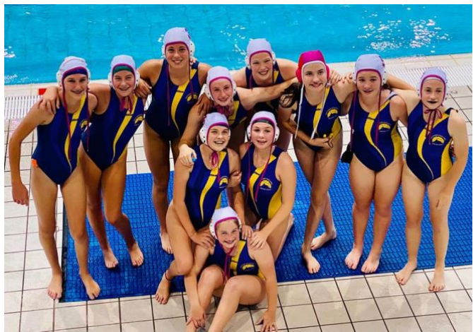
SHWP NSW GIRLS STATE CHAMPIONSHIPS TEAM 2020