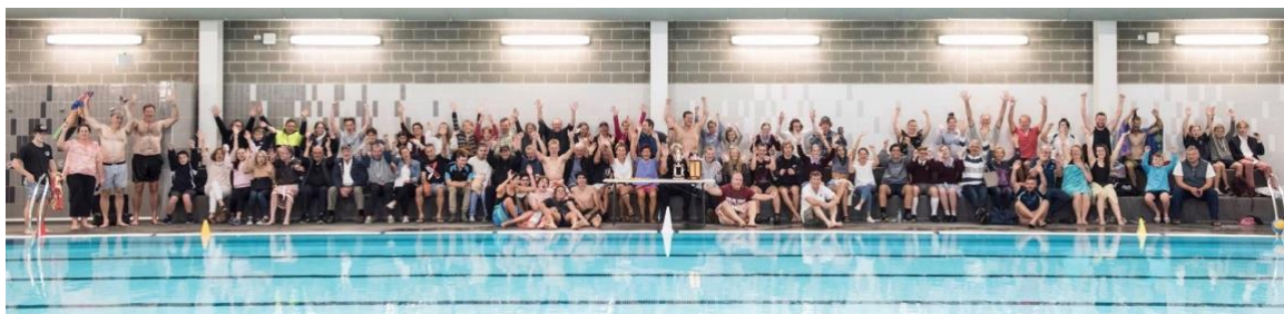
The crowd roars!