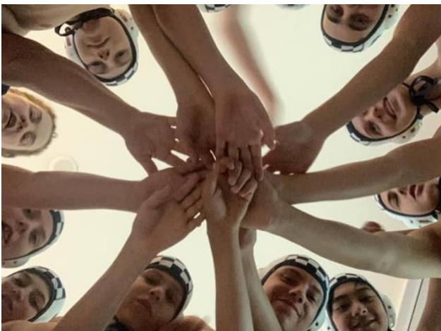
SHWP BOYS NSW STATE CHAMPIONSHIPS TEAM 2020