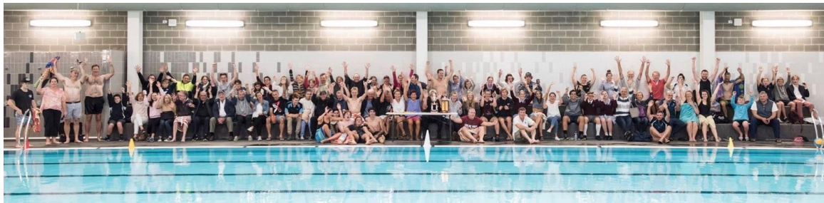
The crowd roars!