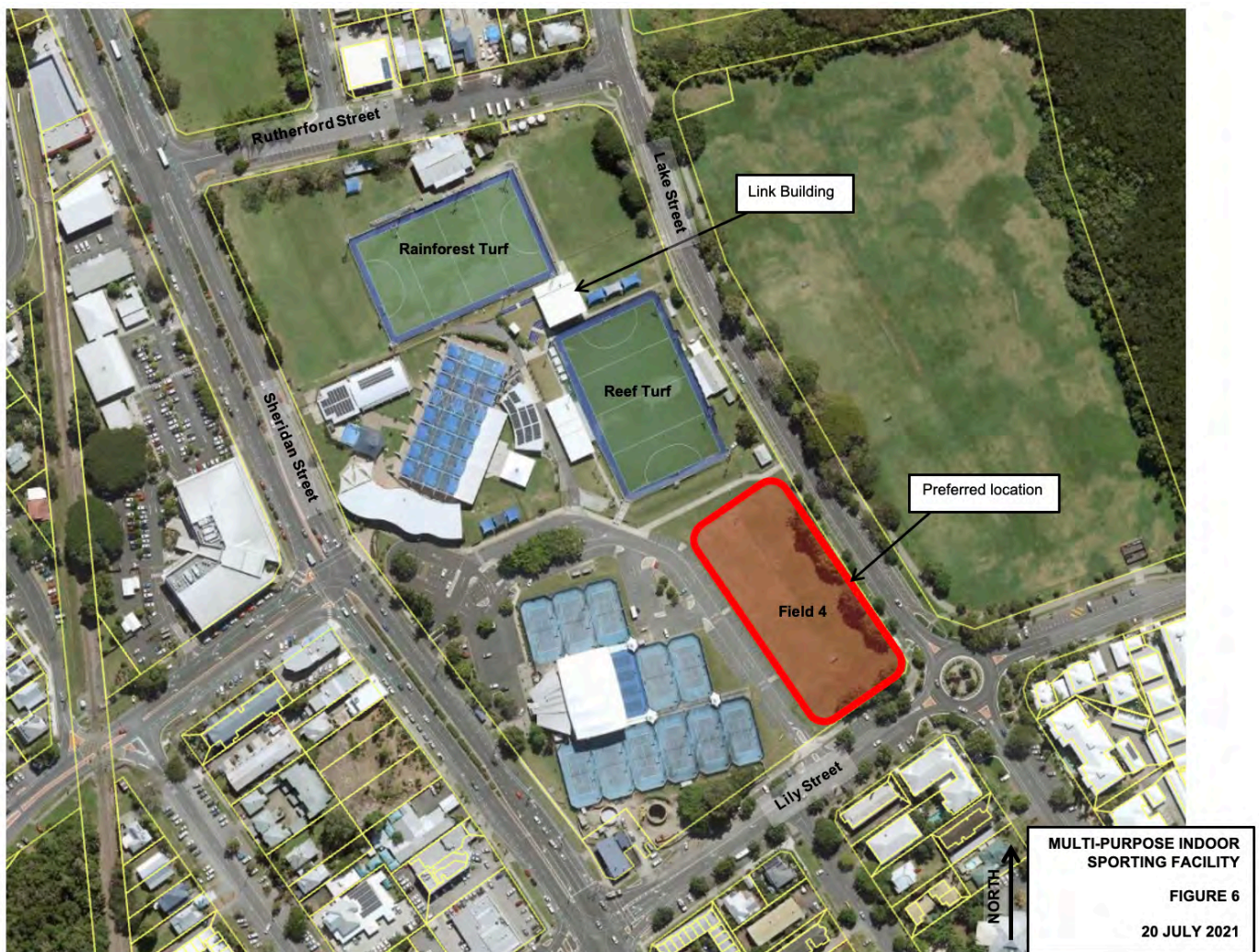
FIGURE 6 INFRASTRUCTURE PLAN – MULTI-PURPOSE INDOOR FACILITY