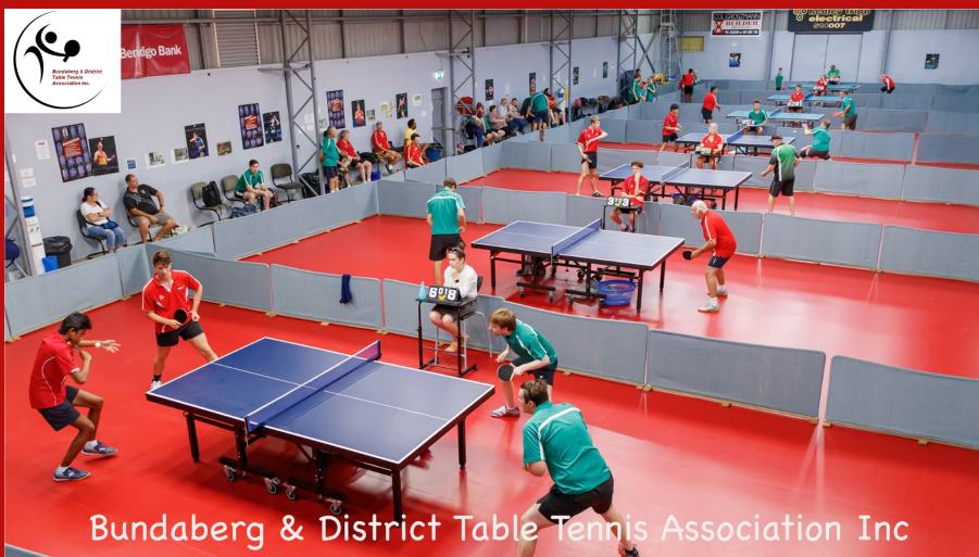
Bundaberg & District Table Tennis Association Inc

HI EVERYONE...We are at the start of a new school term and the start of new Senior and Junior fixtures, plus there are quite a few other events on the horizon, so .... please read on: