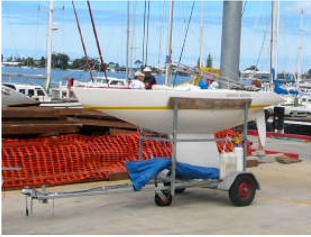
Barry Coates's trolley on wheels has travelled Australia, cost – a couple of wheels

With some engineering skill (and daring) you can build your own trailer