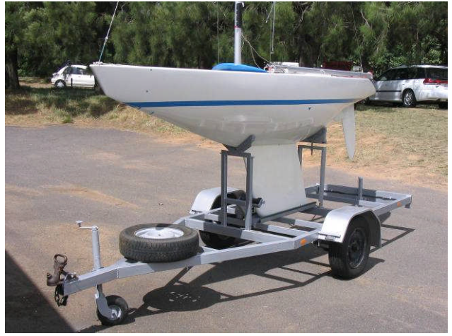
Tony Ryan's trailer is an engineer's dream, cost $1,000