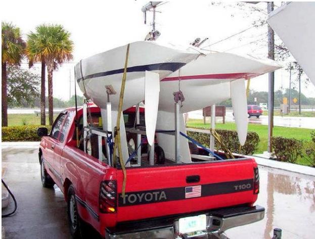
Look no trailer (great ute)