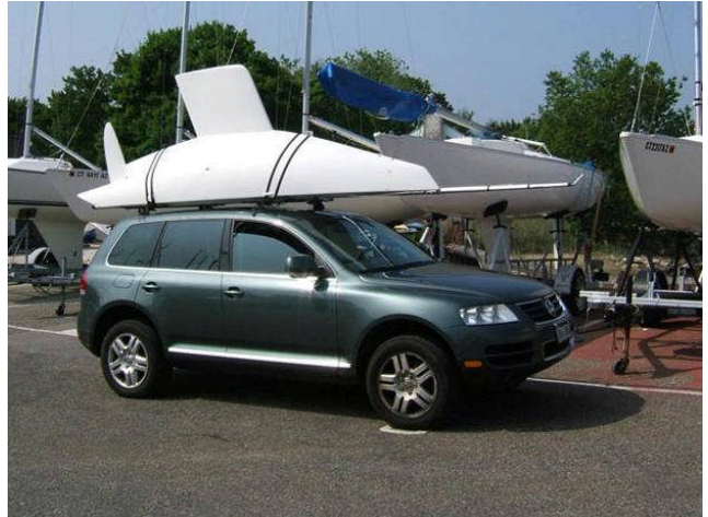
Shark bait (nice car)