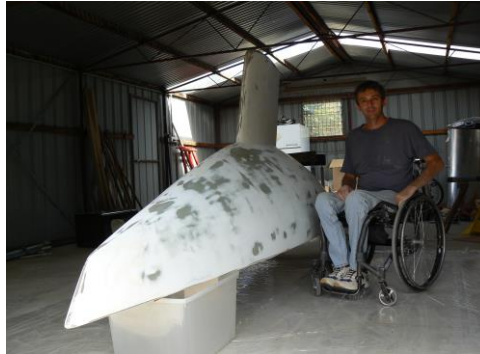
No paint makes a patch job