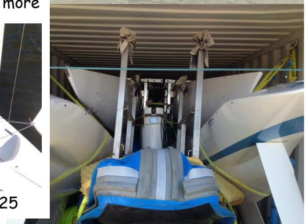
container packed for Europe