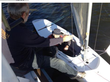
A new chapter for AUS 25