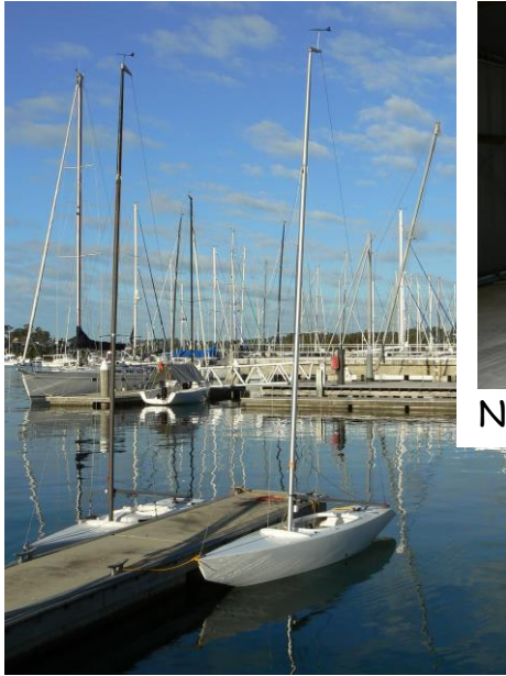
Pittwater trial reflections