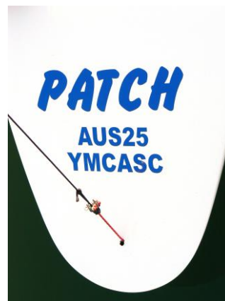
Futs & Fugly no more